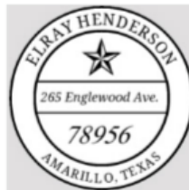
MONOGRAM A01 ROUND STAMP